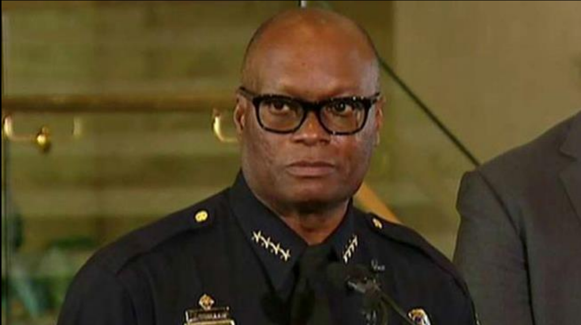
Dallas Chief David Brown

We're sworn to protect you and your right to protest.