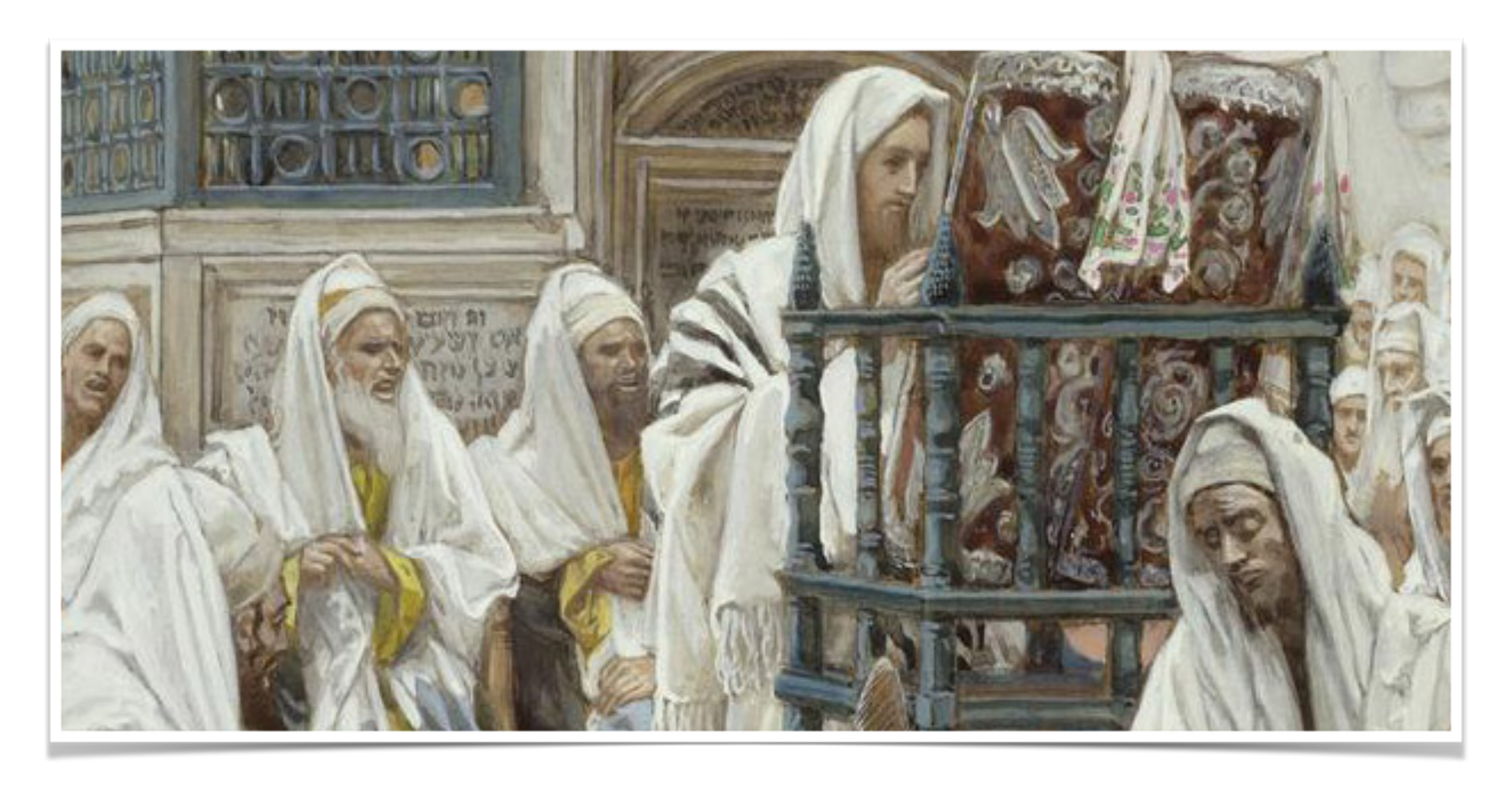
The Jerusalem Bible School