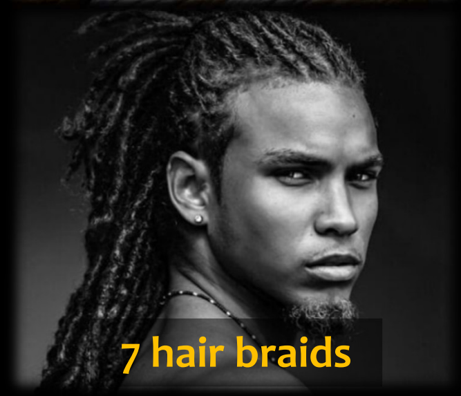
7 hair braids